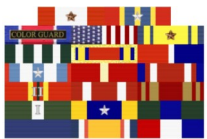
A properly displayed rack shows pride in your unit and yourself.

Ribbons have been updated to the best of my knowledge. Please log into your record book and verify they are correct. (you will be instructed how to log on under the “record book” section of this publication. If there is a discrepancies please email me. The ribbon policy of this unit will be as follows, when you earn a ribbon the initial issue along with the certificate will be given to you. YOU are responsible for purchasing a new rack to add the additional ribbon. Devices earned for subsequent awards will also be issued when you complete the requirements. If you lose or damage a ribbon or device you may contact me and purchase a replacement ribbon or device. Ribbon and devices are $1.00 each.