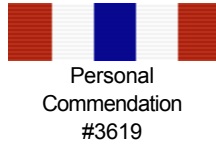
Personal Commendation #3619