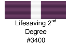
Lifesaving 2 nd Degree #3400