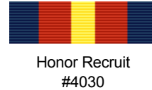
Honor Recruit #4030