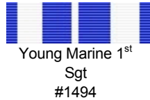
Young Marine 1 st Sgt #1494