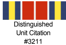
Distinguished Unit Citation #3211