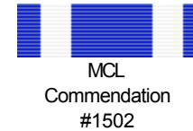
MCL Commendation #1502