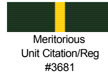
Meritorious Unit Citation/Reg #3681