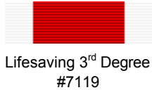
Lifesaving 3 rd Degree #7119