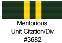
Meritorious Unit Citation/Div #3682