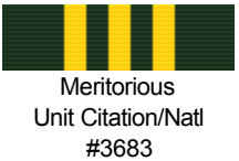
Meritorious Unit Citation/Natl #3683