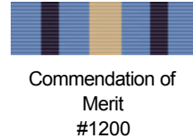
Commendation of Merit #1200