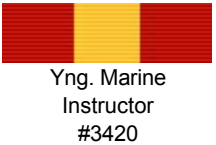
Yng. Marine Instructor #3420