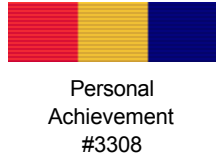
Personal Achievement #3308