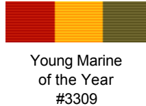
Young Marine of the Year #3309