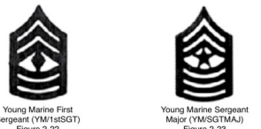
(This is a billeted rank for YMMSGT only) (This is a billeted rank for YMMGYSGT only)